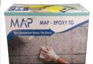
MAP - Epoxy TG