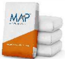
MAP – Floor Shield (MT)