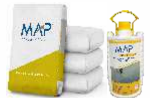
MAP – Shield

DESCRIPTION High-performance bitumen and polymer based black coloured liquid membrane. APPLICATION Roof garden, balconies and terrace area, concrete, cement render basement, parking area, podium deck area, etc. for waterproofing. COVERAGE 3m 2 / Kg / 2 coats PACKAGES 1 Kg, 5 Kg, 20 Kg