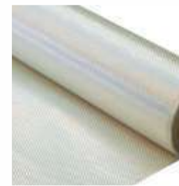
Glass Wall Cover