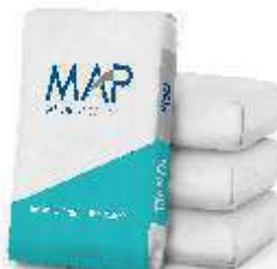
MAP – Wall Putty