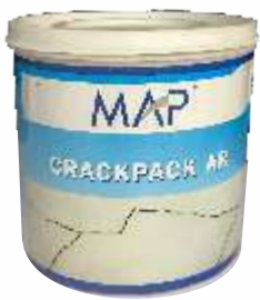
CRACK PACK AR

DESCRIPTION Modified styrene-butadiene latex is a milky white liquid. APPLICATION Waterproofing, concrete repair, floor topping, bonding of screed & render, repair of large crack, etc. COVERAGE 6-8 m 2 / L PACKAGES 500 ml, 1 L, 5 L, 10 L, 20 L