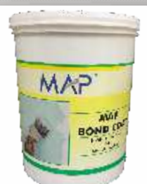
MAP – Bond Coat