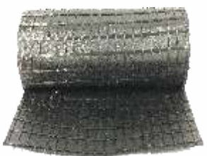
MAP – Underlayment