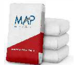
RMM - Ready Mix Mortar

Depends on the surface and application. PACKAGES 20 / 40 Kg