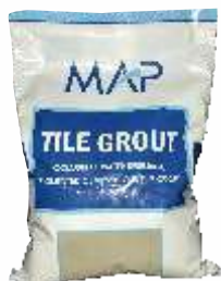
MAP – Tile Grout