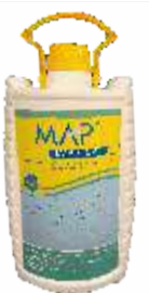
MAP – Stop

DESCRIPTION Two component, flexible modified coating which is a grey cementitious material and white liquid. APPLICATION Concrete surface, balcony, terrace, bathroom & swimming pool for waterproofing. COVERAGE 11 m / 2 coat / 10 kg + 5 L PACKAGES 2 kg + 1 L, 10 kg + 5 L, 20 Kg + 10 L