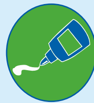
ADHESIVE BONDING AGENT