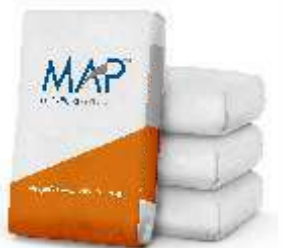
MAP – Floor Shield (CR)