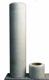
TBM – Matrix