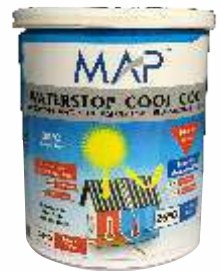
WaterStop Cool Cool

DESCRIPTION Highly flexible & 100% acrylic polymer based single component white coloured paste. APPLICATION It is used for filling internal & external surface cracks in plaster up to 10 mm width. COVERAGE 40 M / Kg / 6mm x 6mm 'V' Groove. PACKAGES 1 Kg, 5 Kg