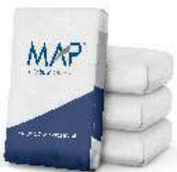
Premix Plast (E)