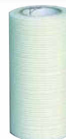
MAP - Magic Tape