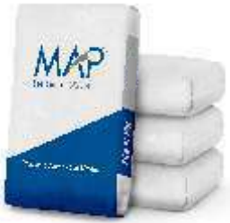
Tile N Fix