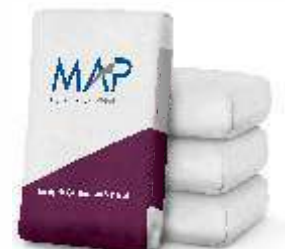
Premix Plast (I)

15 – 16 sq.ft @ 15 – 16mm / bag PACKAGES 40 Kg