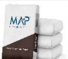
MAP – Micro Concrete

Depends on the surface and application. PACKAGES 25 Kg