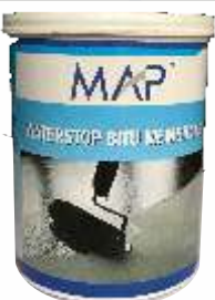
Water Stop Bitu Membrane

DESCRIPTION Single component ready to use pure acrylic white coloured paste. APPLICATION Building roof / terrace - flat & slope, galvanised sheet, over existing cementitious surface, concrete screed and china mosaic for thermal insulation & waterproofing coat. COVERAGE 6.5 sqm. / coat / kg PACKAGES 1 Kg, 5 Kg, 20 kg