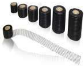
TBM – Reinforcement