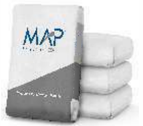
MAP – Floor Grout GP 2