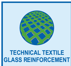
TECHNICAL TEXTILE GLASS REINFORCEMENT