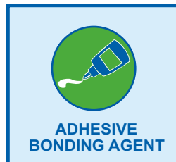
ADHESIVE BONDING AGENT